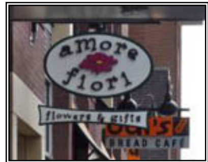
Wall Sign (Perpendicular)

WW. Wall Sign (Perpendicular): A permanent sign attached directly to and perpendicular to the exterior wall of a building.