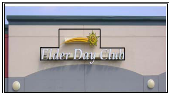
Use of Rectangles to Calculate Area

2. When a sign consists solely of lettering or other sign elements printed, painted or mounted on a wall of a building without any distinguishing border, panel or background, the calculation for sign area shall be measured by enclosing the most protruding edges of the sign elements within a parallelogram or rectangle.