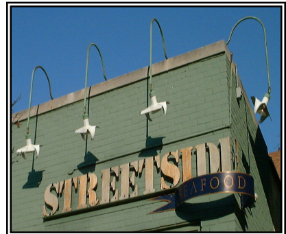
Front Lit Wall Sign Gooseneck lights