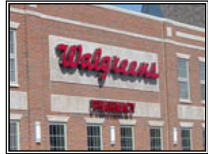
Wall Sign (Parallel)

UU. Vehicle Sign: A sign that is attached to, painted on, or otherwise displayed on a vehicle that is parked on or adjacent to any property, the principal purpose which is to attract attention to a product sold or business located on the property.